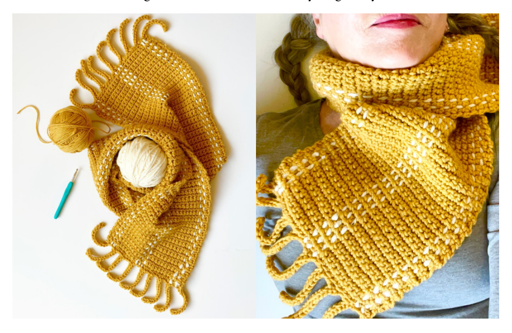
Pattern by Sugar Joye

Single Crochet Weave Scarf by Sugar Joye