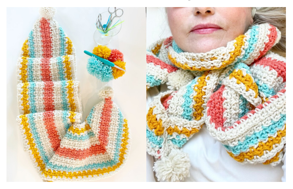
Pattern by Sugar Joye