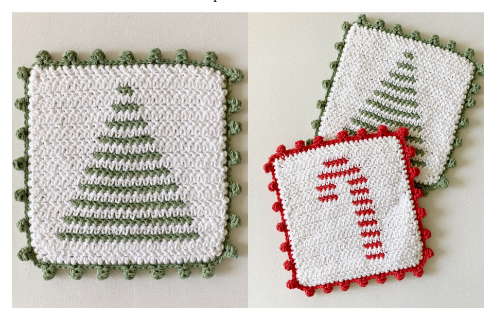
Pattern by Tiffany Brown

Crochet Tree Stripe Hot Pad with Dot Border